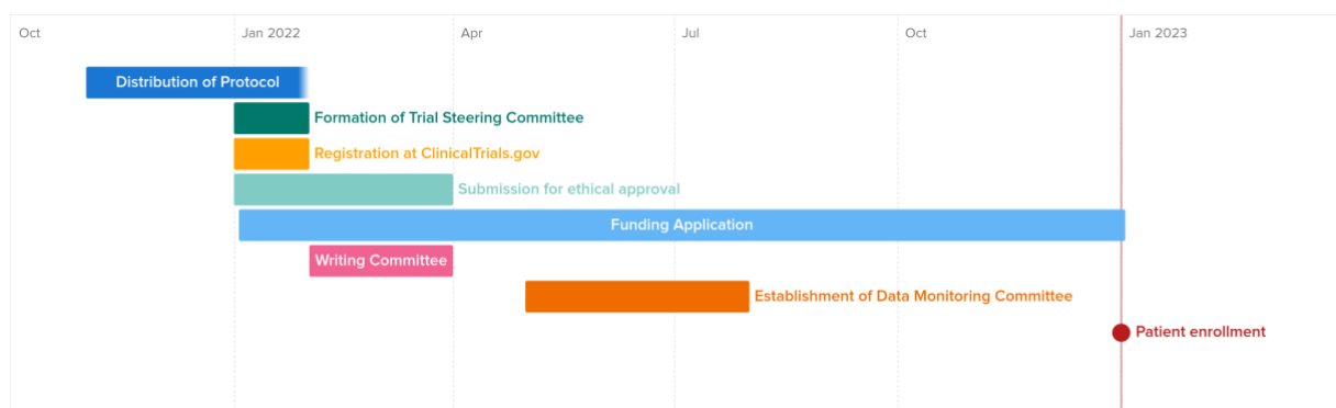
Figure 3: Tentative project timetable.

The tentative timetable provided below in Figure 3 will be updated accordingly.